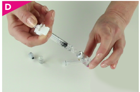
Press the plunger down firmly to empty all the solution onto the powder.

Push the needle through the rubber top in the centre of the vial.