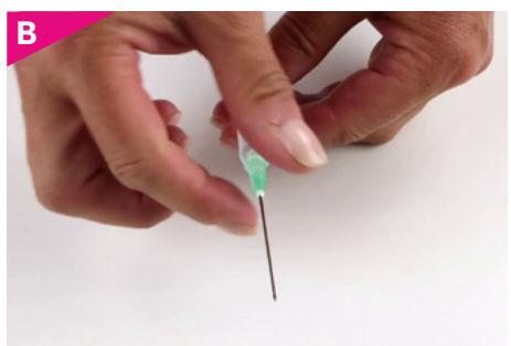
Detach the needle from the syringe and dispose of it in the sharps bin along with the empty vials.

When the contents of the correct number of vials have been drawn up into the syringe. Point the needle upwards and replace the protective cover on the drawing up needle.